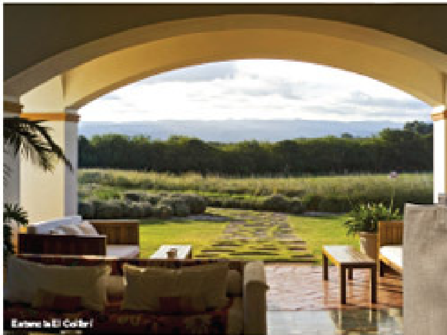
Estimote 360 Collection