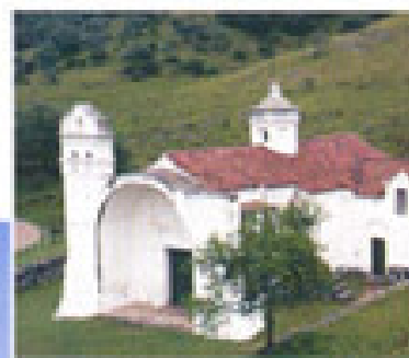
GRAND CANYONS THE SPECTACULAR LANDSCAPE OF SALTA. RIGHT, A JESUIT CHURCH IN CÓRDOBA.

toric Colomé vineyards and winery enjoy a ravishing high-altitude setting (from 7,200 to 9,200 feet) within the famously beautiful Calchaquí Valley. A year ago, Colomé owners added a glamorous boutique hotel to its extensive domain. A contemporary take on a traditional estancia, Estancia Colomé is a compound of low tile-roofed adobe buildings that include stables, gracious public rooms, and nine well-appointed suites with terra-cotta floors and fireplaces, and contemporary furniture. Besides its wine operations, Colomé has become known for its "biodynamic" farming methods, which means guests at the estancia dine on some of the freshest and healthiest cuisine in Argentina. Along with the usual horseback riding, hiking, biking, and tennis, the resort also offers insider tours of its vineyards and brand-new winery. Nearby, the mountain towns of Molinos and Cachi are two of Salta's most picturesque. Doubles from $290, including all meals; 54-386-849-4044 or -4043; estanciacolome.com . — REINHOLD ALTMAN pata >425